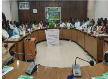
ಸಂಕಿರಣದ ಉದ್ಘಾಟನೆ ಸಮಾರಂಭದಲ್ಲಿ ಭಾಗವಹಿಸುತ್ತಿರುವವರು.

ಕರ್ನಾಟಕ ಧಾನ್ಯ ಸಂಘದ ಸುಮಾರು ಹತ್ತಾರು ಚಿಕ್ಕ ಹಳ್ಳಿಗಳಲ್ಲಿ ಸ್ವಯಂಸಹಾಯ ಸಂಘಗಳನ್ನು ಕೆಲವು ಬಡತನ ನಿವಾರಣೆ ಹಾಗೂ ಸ್ವಾವಲಂಬಿ ಬಡತನ ನಿವಾರಣೆ ಹಾಗೂ ಮಹಿಳೆಯರ ಅನಿವಾರ್ಯತೆಗಳ ಬದಲಾವಣೆಯ ಪರಿಷ್ಕರಣೆಗಳನ್ನು ಪ್ರಕಟಿಸುವುದು.