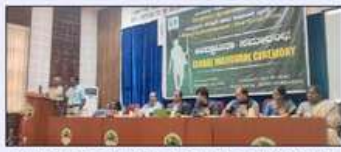
ಮಹಿಳಾ ವಿಚಾರ ಸಂಕಿರಣದ ಉದ್ಘಾಟನೆ ಸಮಾರಂಭದಲ್ಲಿ ಭಾಗವಹಿಸುತ್ತಿರುವವರು.