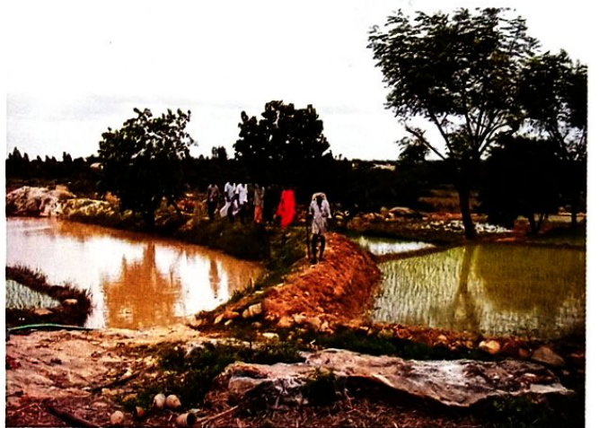
Tank treated under Watershed Programme