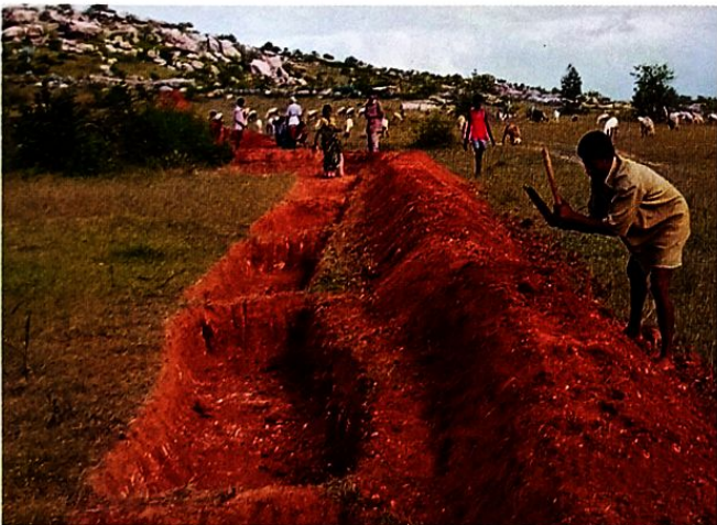
People involvement in Watershed Development work