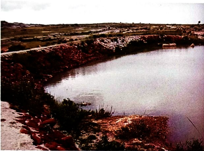
Tank treated under Watershed Development Programme