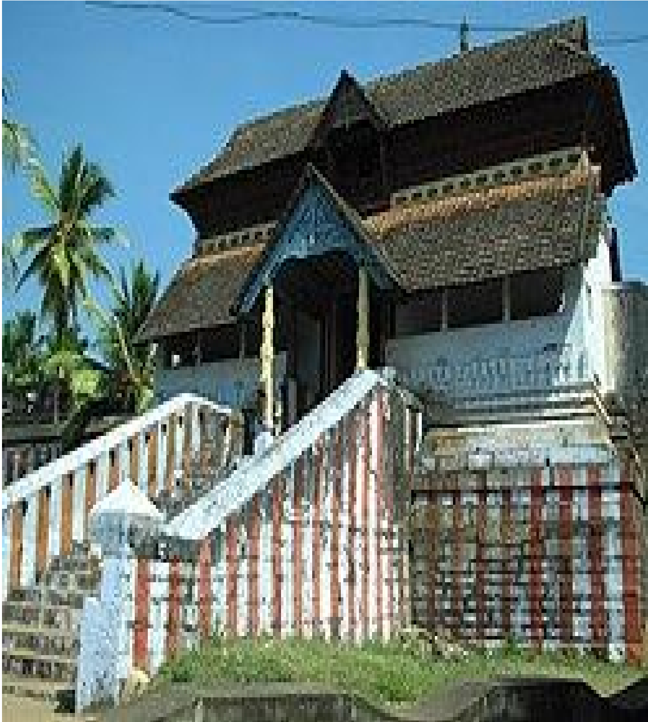
Adhikesava Temple- Front Elevation- Tiruvattar