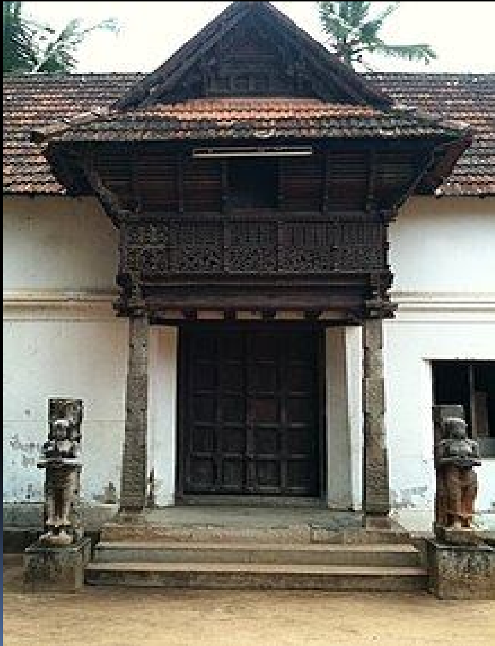
Entrance - padmanabhapuram