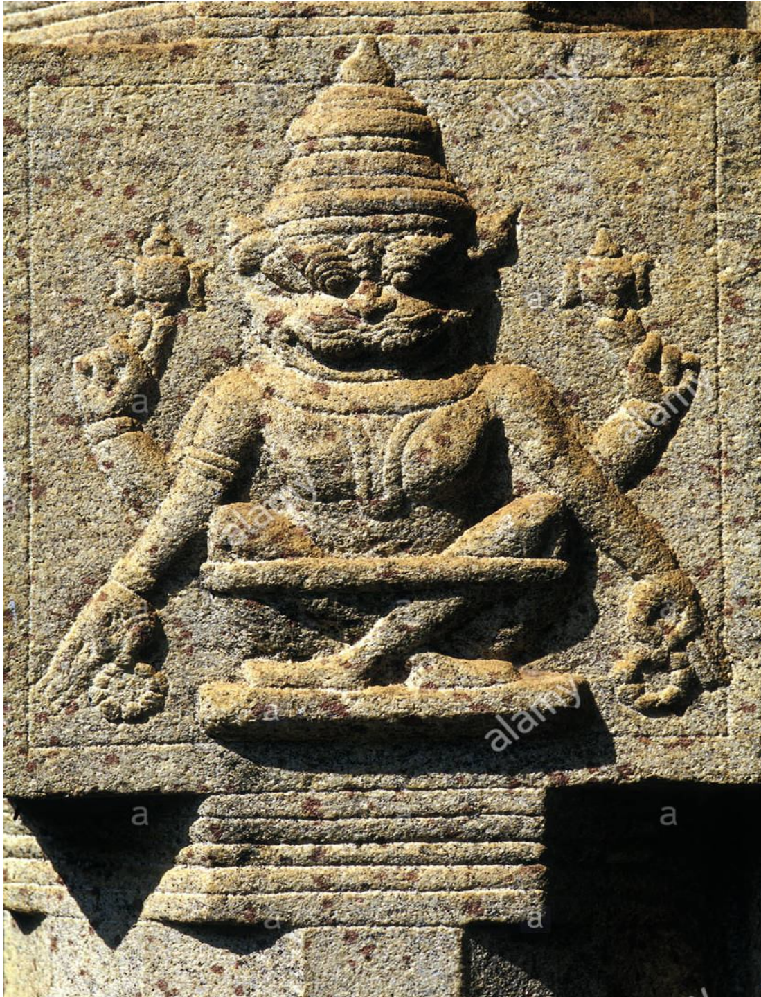
Yoga Narasimha- Adhikesavaperumal temple-Tiruvattar