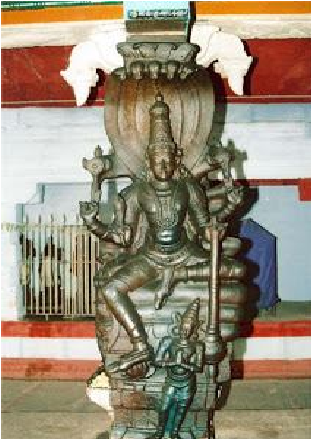
Vishnu as vaikundanatha- Thadikkombu