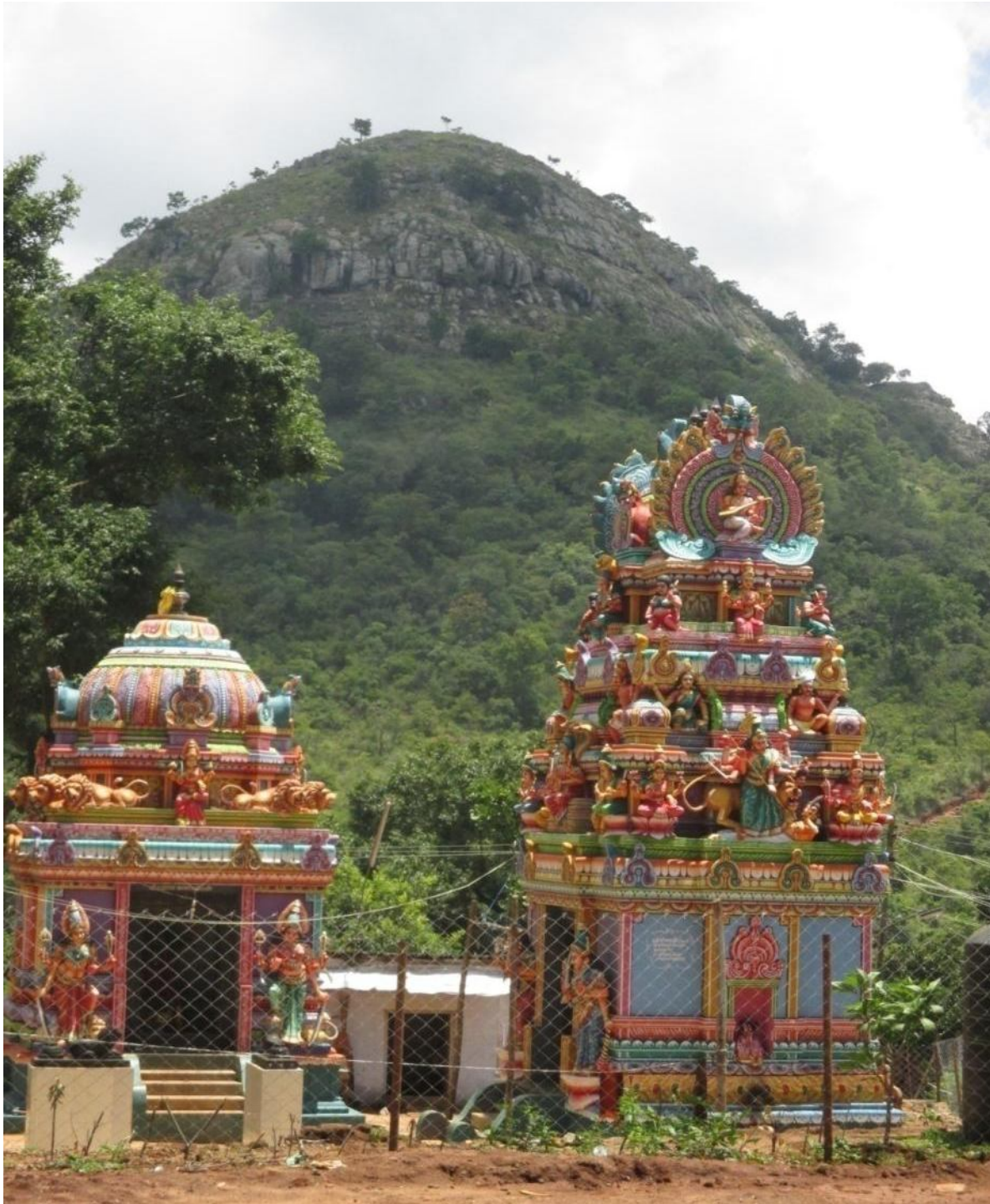
Agasthiyar Temple- Vellimalai- Sirumalai