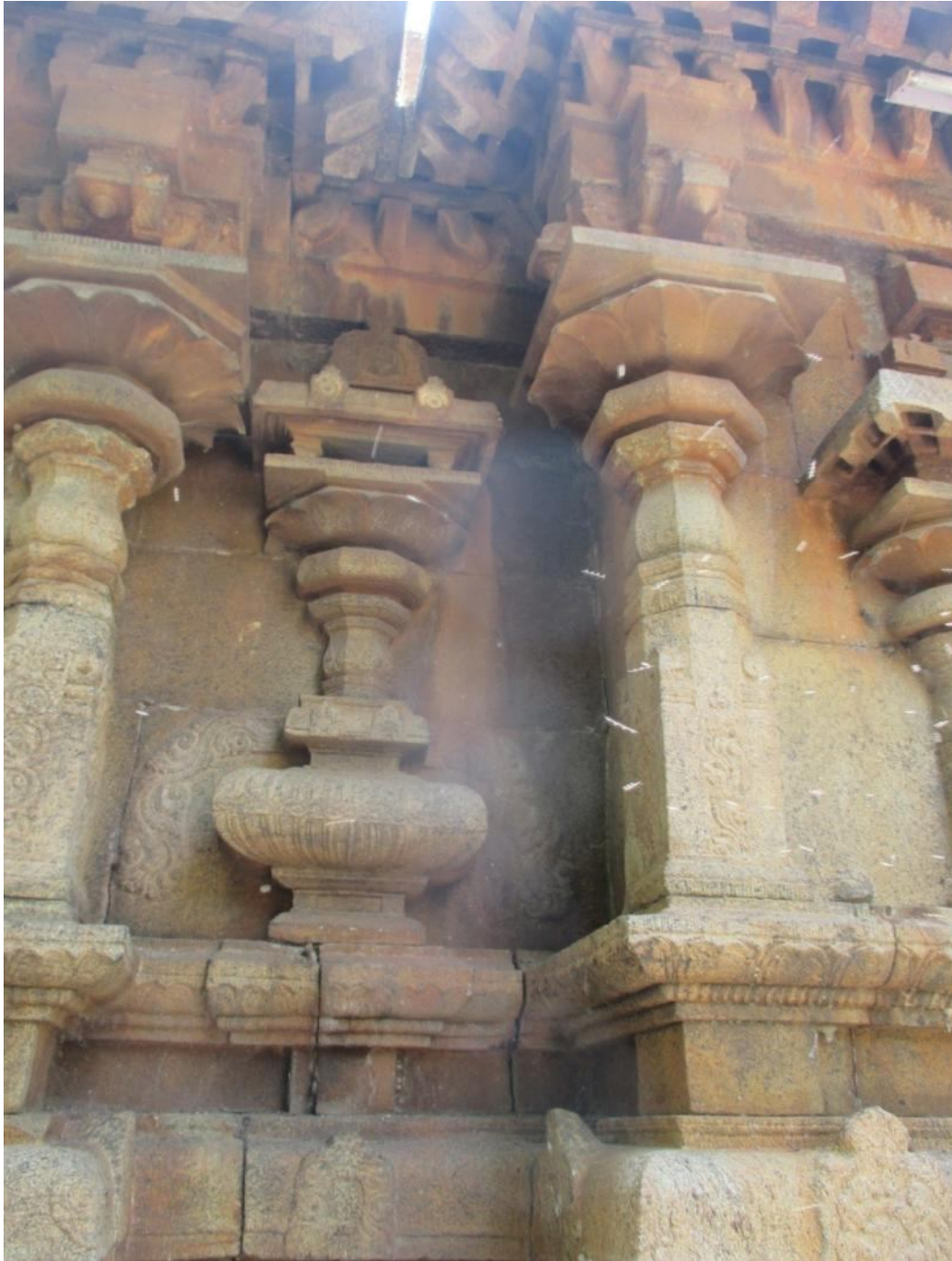
Wall portion – Setharaisvaramudayar Temple