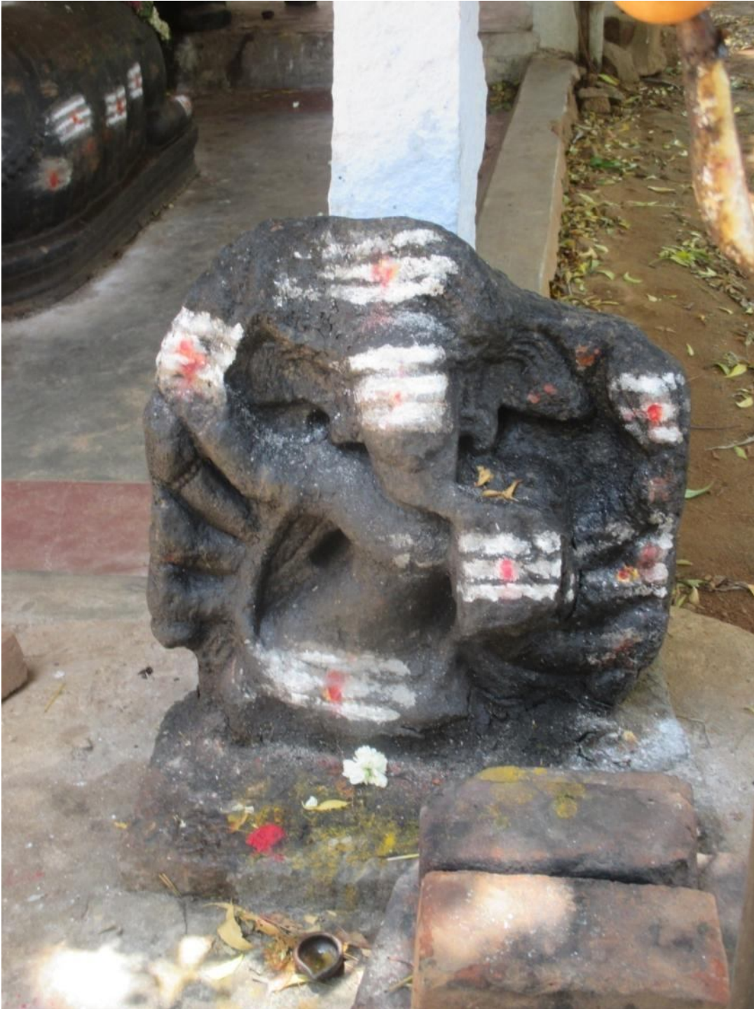
Ganapati- Setharaisvaramudayar Temple- Alagarnayakkanpatti