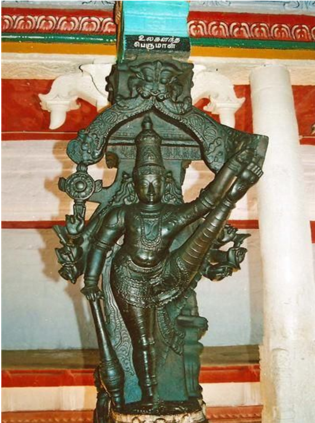
Trivikrama - Thandikkombu