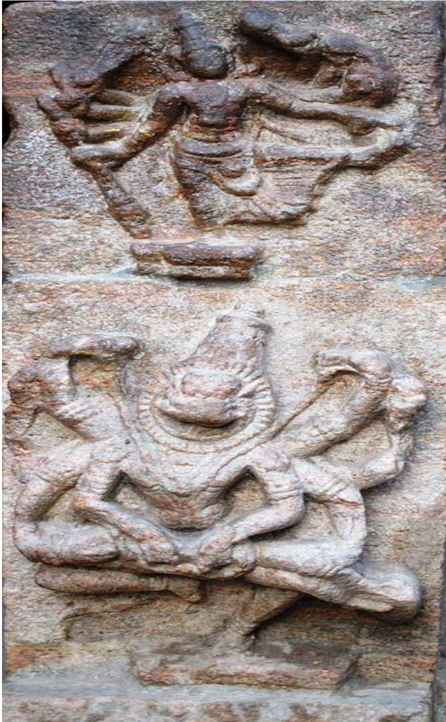
Pillar Sculptures- Soundararajaperumal Temple- Thadikkombu