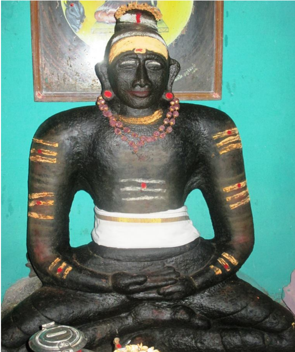
Thousand year Old Buddha Statue- Atthur