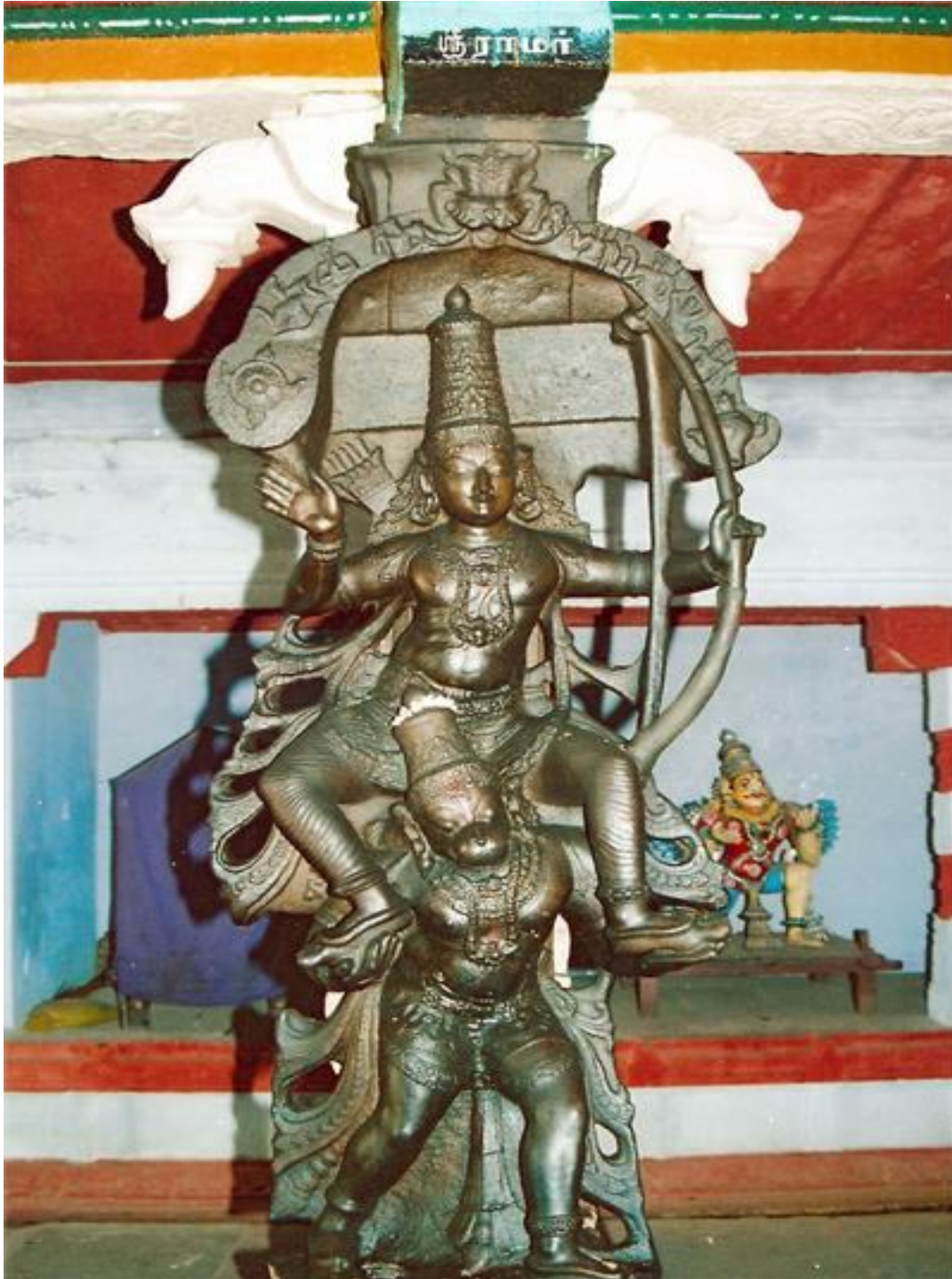
Sri Rama carried by Hanuman