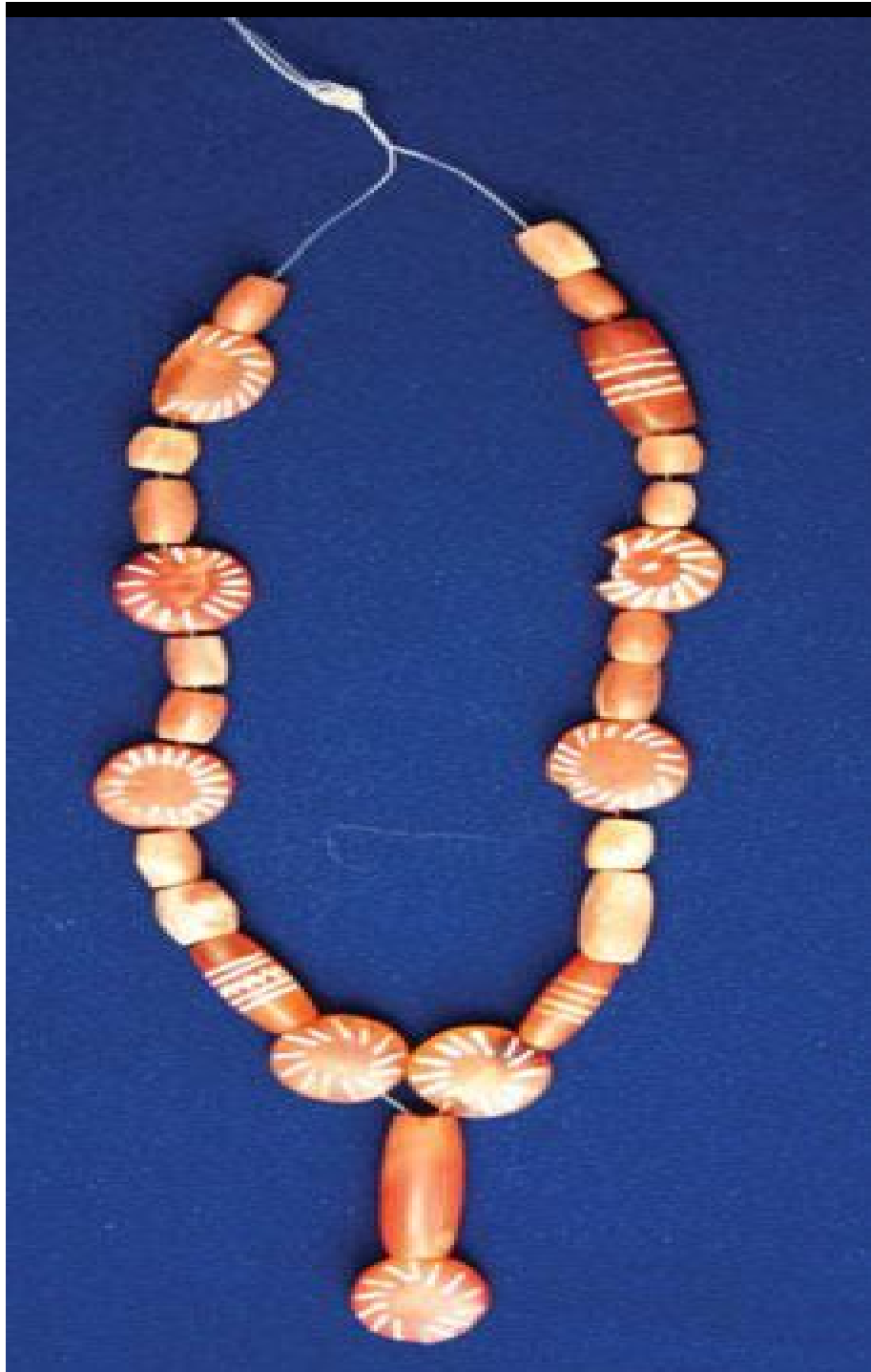
Garland of Beads- Thandikkudi