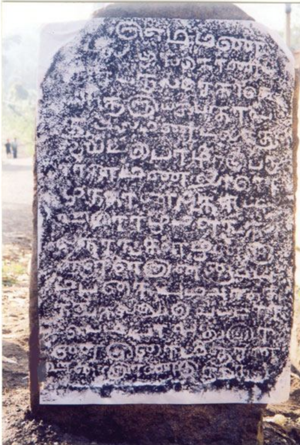
Trade Guild Inscription- Thandikkudi