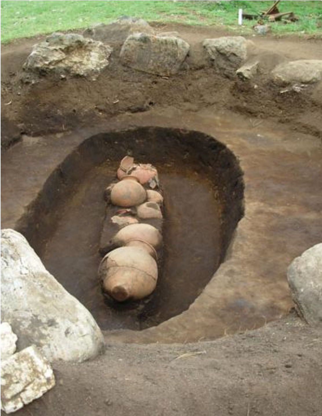
Cairn Circle- Thandikkudi