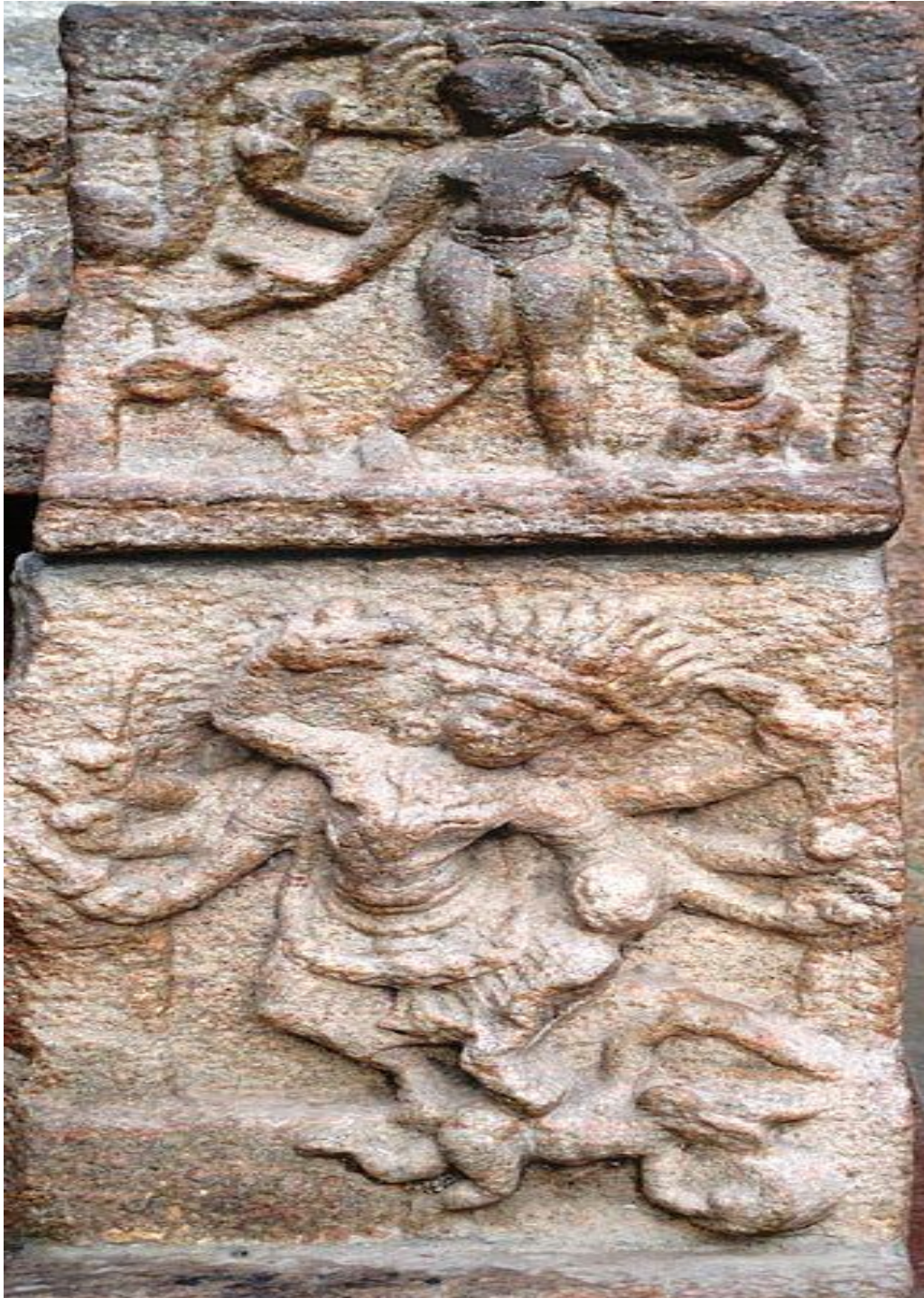
Pillar Sculptures- Soundararajaperumal Temple- Thadikkombu